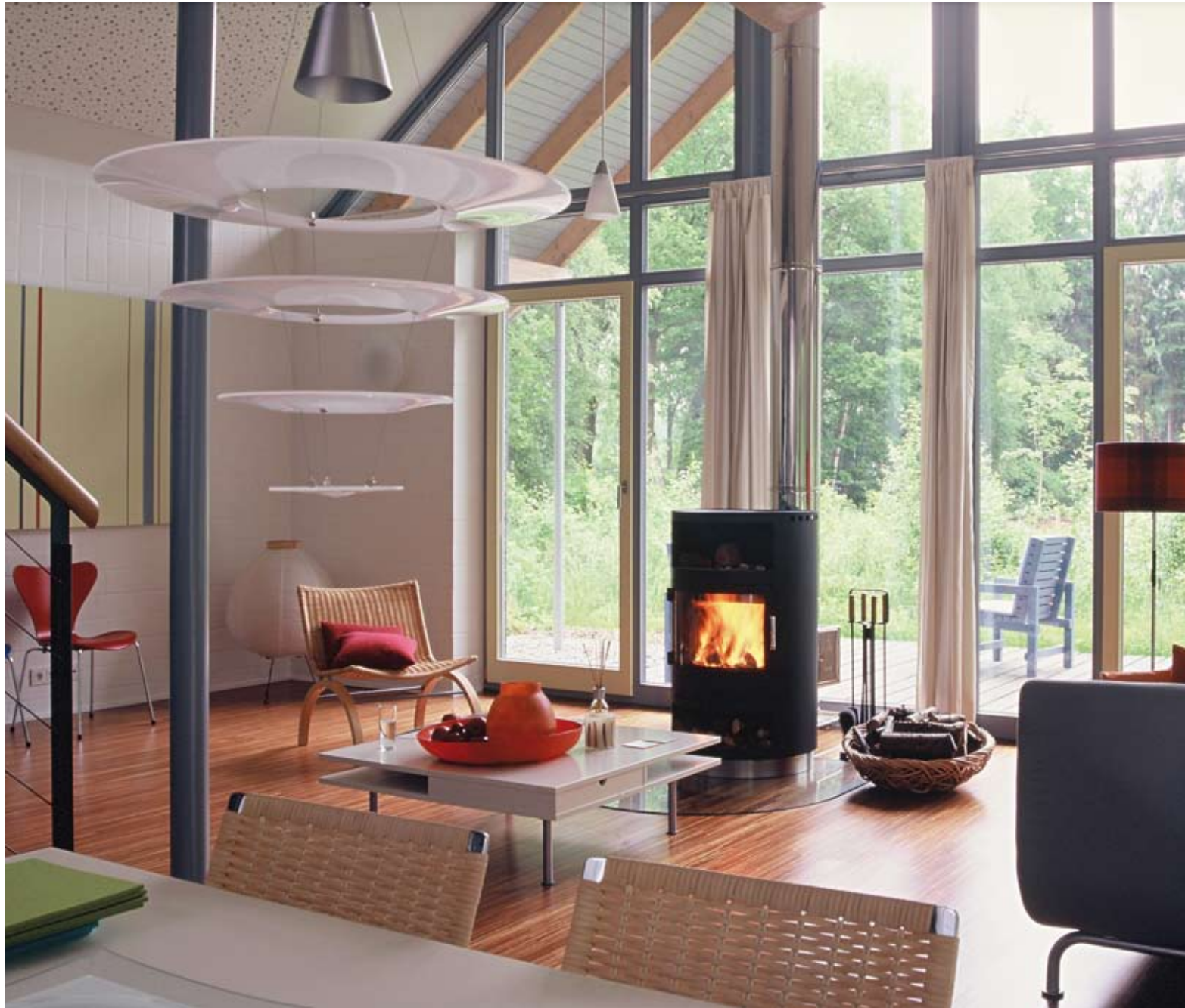
↑ | Living room with fireplace → | Dining area and gallery

Address: Friedrichsdorf 61 b, 27442 Gnarrenburg, Germany. Client: Torsten Stelling. Completion: 2004. Costs: 100,000 EUR. Burgers total: XX. Gross floor area: 133 m 2 . Burgers / m 2 : XX. Means to reduce cost: simple floor plans and building structure, wide open room concept without partition walls, no plaster, only three inner doors, only one bathroom.